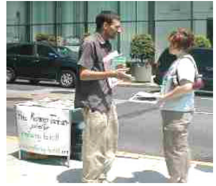
... and in the US...

INTERNATIONAL PROTESTS: Wages Due Lesbians and Payday will picket Turkish Airlines in London, UK , and have speak-out in Philadelphia – Other groups will protest in Turkey (Istanbul, Ankara, Izmir, Sivas) – Finland (Helsinki) – France (Paris) - Germany (Frankfurt, Berlin, Mainz, Münster) – Holland (The Hague) - Italy (Venice) – Poland (Warsaw) - Scotland (Glasgow) – Serbia (Belgrade) - US (New York)