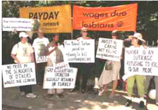
12 July, Wages Due Lesbians and Payday picket the Turkish embassy in England...