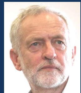
Payday has been supporting the Jeremy for Labour Campaign