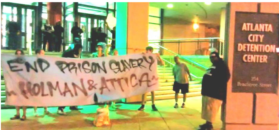
The 9 September was chosen because on 9 September 1971, prisoners took over and shut down Attica, New York State's most notorious prison.